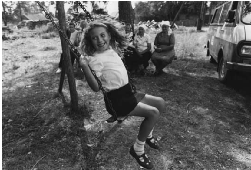
By Seiichi Motohashi